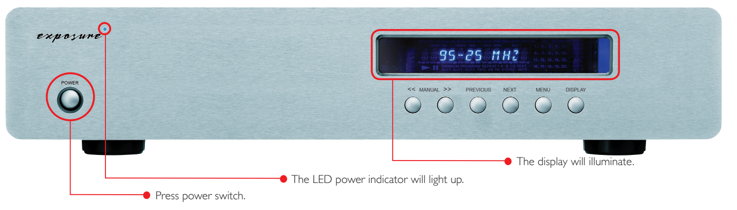
The Exposure 2010S2 FM Tuner : Front View

Ensure that the volume control knob or your amplifier is set to minimum.